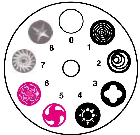
side towards the lamp

SGM reserves the right to modify any specifications without prior notice.